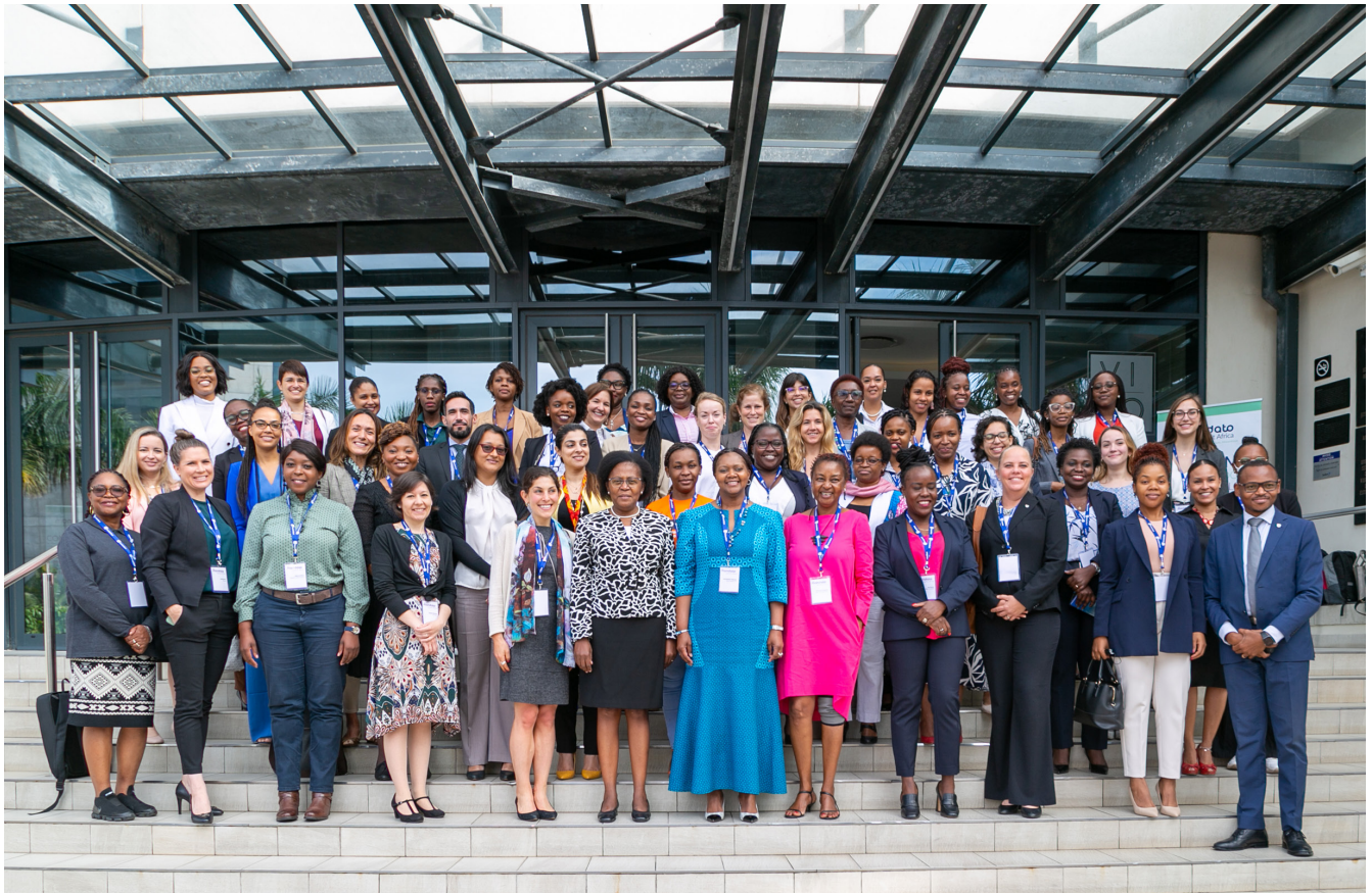
Mondato Summit Africa welcomed over 50 women for a session on “Promoting Female Leadership Across the Financial Sector”